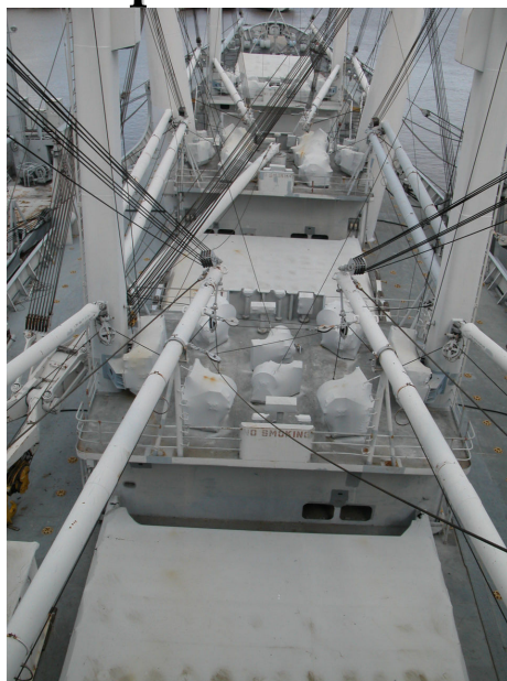
2006 photo of 1 of 4 Maritime Administration Ready Reserve Fleet freighters wrapped in 2003 in Intercept Shrinkfilm and coated with FPM's colored matched Shrinkwrap Coating System