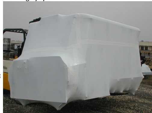
one of several AM General trucks in storage

“Static Intercept (SI) resin prevents 1ppm chlorine (marine layer concentration) from penetrating 2-mil of low density polyethylene (LDPE) with SI for 34.5 years compared to 7.4 days for regular LDPE” - Dupont Analytical Lab