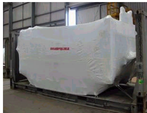
mining equipment stored in Australian Outback